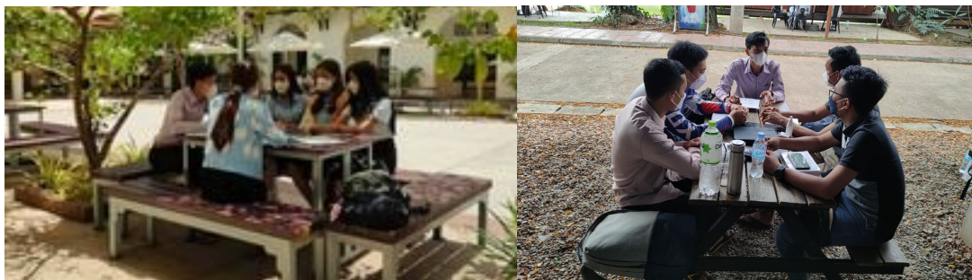
Focus Group discussion with university students for the need assessment on GBV Safe App.

In collaboration with an external expert, UNFPA and MoWA have developed the assessment methods and plan, including interview tools, in March. The interview with App users, NGOs, Ministry officials, and hospitals have just started in April.