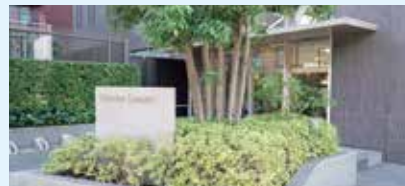
Wesley Center Entrance